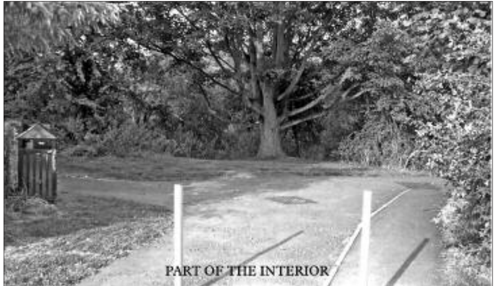
PART OF THE INTERIOR

Off Tantree Way in Eaglehurst, there is a jewel – an oasis of tranquillity – an open space for all to use – with freshly mown grass and an excellent place for a picnic.