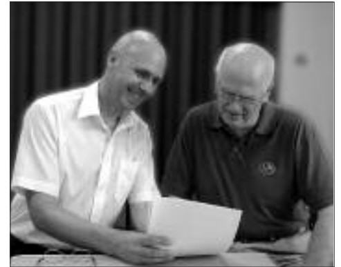
Village Hall Committee Chairman & Treasurer